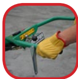
Tine, wheel drive & clutch operator controls