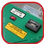
Tachometer shows engine RPM & service intervals