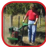
Side operation for operator ease