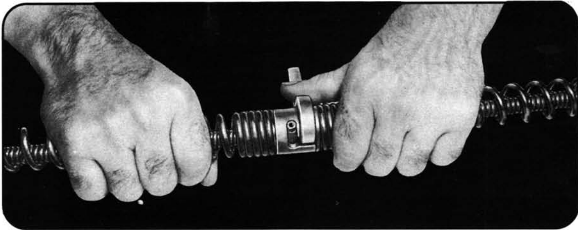
Figure 2 Separating cables with spanner wrench